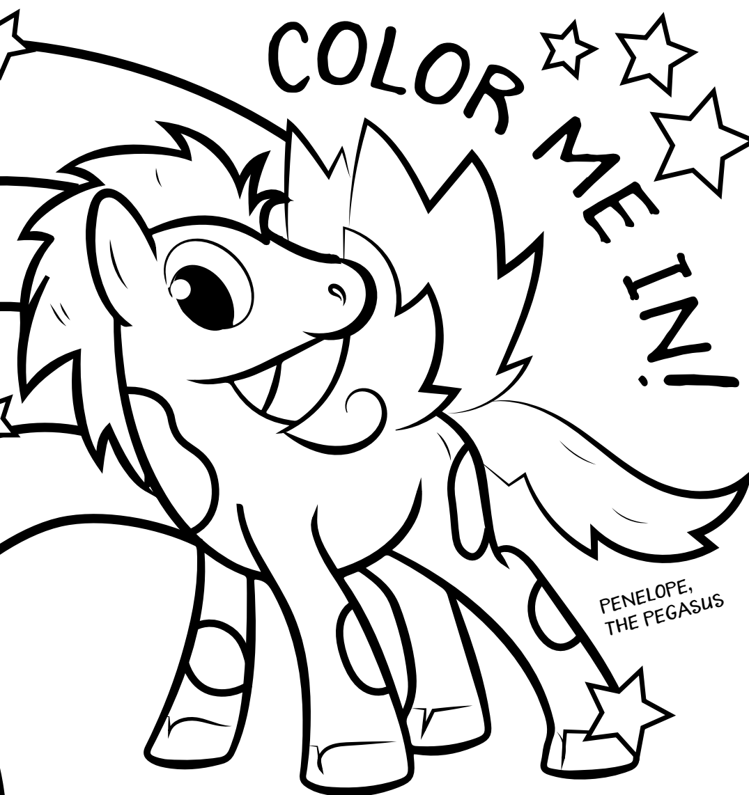
PENELOPE, THE PEGASUS

CAN YOU UNSCRAMBLE THE NAMES OF ANIMALS YOU FIND AT THE ZOO?